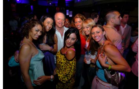
Patrons enjoying their complimentary Wokka Saki at the Grand Opening of Nocturnal Night Club