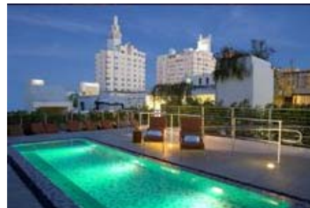
Sanctuary Hotel Rooftop Deck